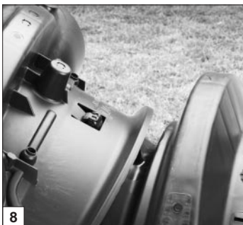
Attach end cap to chamber.

8. The last chamber in the trench requires an end cap. Lift the end cap at a 45-degree angle and insert the connector hook through the opening on the top of the end cap. Applying firm pressure,