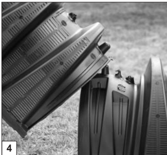
Connect the chambers.

Note: When the chamber end is placed between the connector hook and locking pin at a 45-degree angle, the pin will be visible from the back side of the chamber.