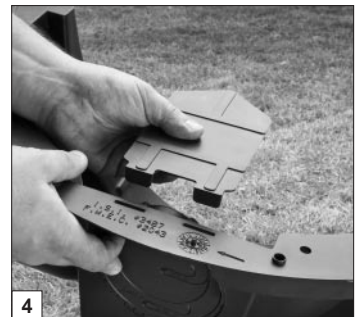
4 Install splash plate.