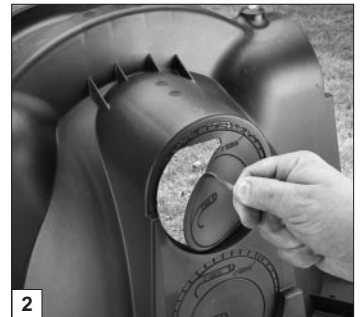
2 Pull tab on tear-out seal.