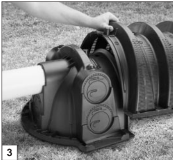
Place first chamber onto end cap.

3. Place the inlet end of the first chamber over the back edge of the end cap.