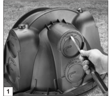
1 Start tear-out seal.