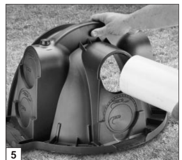
5 Insert inlet pipe.