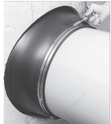
Install Pipe Clamp(s) with T-Handle Torque Wrench