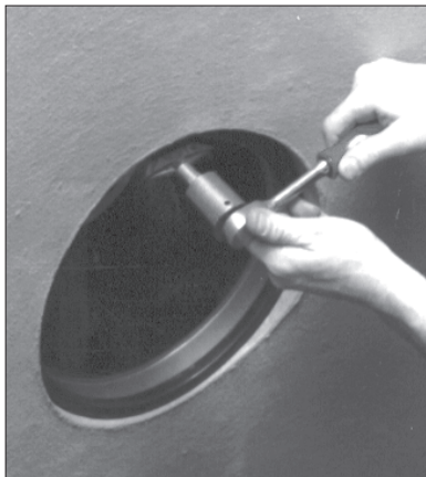
Install Kor-N-Seal I - Wedge Korband with Socket Wrench & Torque Limiter